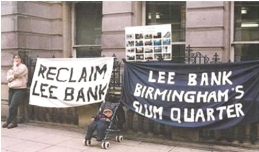
Fig. 6.6 a Residents' protests on Bristol Street, late 1990s, Lee Bank, Birmingham b Residents' protests outside the Council Offices, late 1990s, Lee Bank, Birmingham.