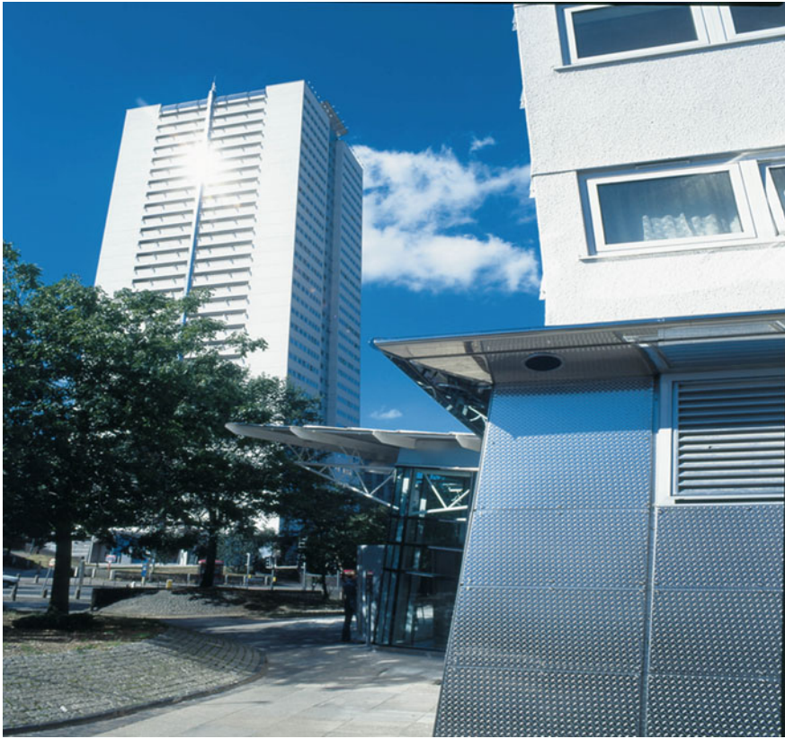
Fig. 6.8 The Sentinels (32-storey blocks) following refurbishment.

the intended private sale price and with grant funding as government sought to deal with problems arising from the credit crunch. Importantly, the developer did not cease trading and continuity of their personnel (and Optima and city council personnel) sustained the underlying strategy.