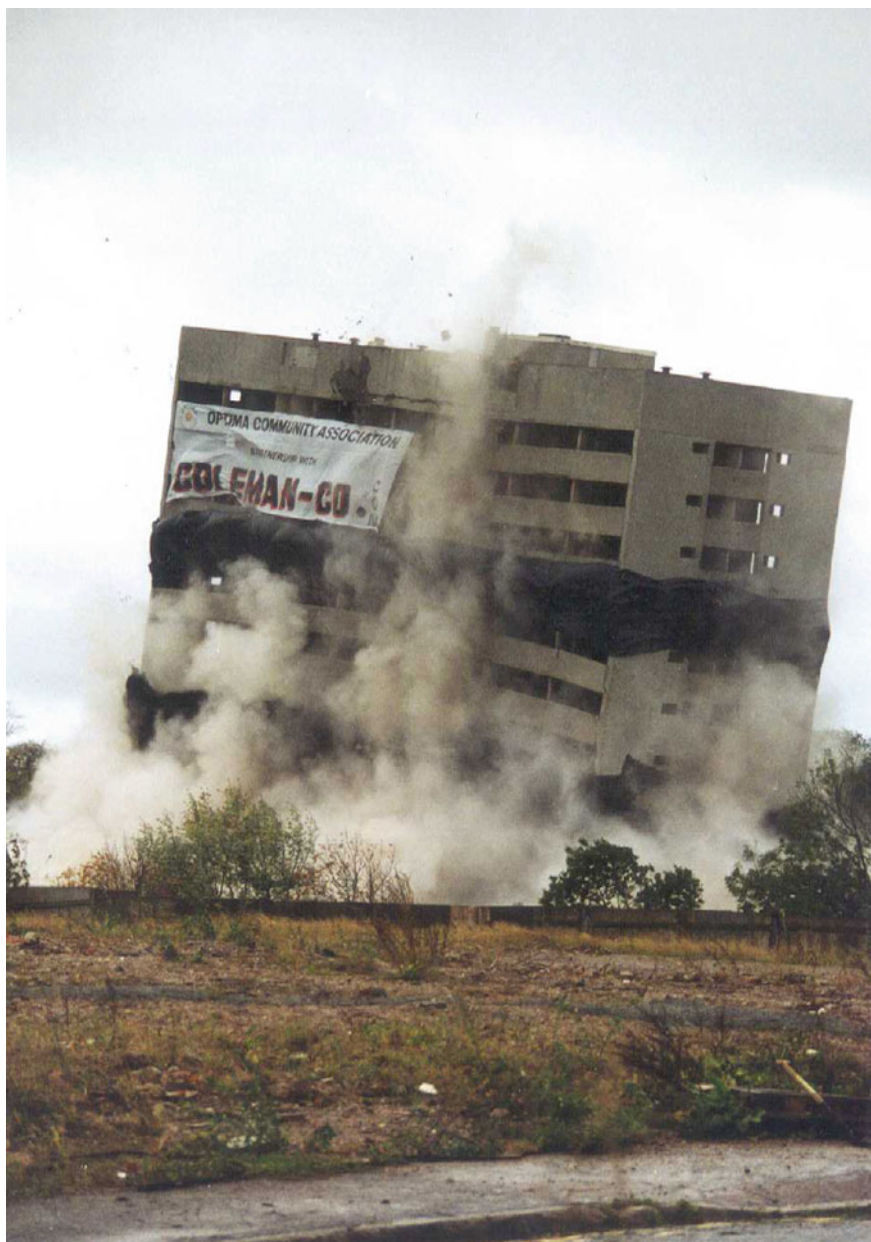
Fig. 6.7 Explosive demolition of Haddon Tower, Lee Bank, Birmingham.