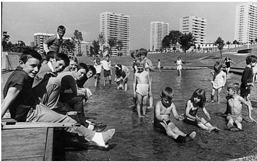
Fig. 6.4 A short-lived paddling pool among towers in the park, 1960s, Lee Bank, Birmingham.

demolished, 1,400 refurbished and over 2,500 new homes in different tenures (including 550 affordable, predominantly social rented, housing). Refurbishments involved modernisation of kitchens and bathrooms, updating of heating systems, replacement of windows, external cladding and insulation—all improving energy efficiency and meeting the Decent Home standard. Regeneration involved redesigning the estate with changes to levels and road layouts, two new, linked parks replacing the unused green space that had existed around tower blocks, two further small parks, new community facilities (including a health centre, school and community centre) and commercial premises (offices, shops and hotels). What was proposed transformed the look and feel of the estates. Major landmark tower blocks were demolished (including Haddon Tower in Fig. 6.7), while others were refurbished to a high standard. These included the highest two blocks (the 32-storey Sentinels) where new windows and exterior cladding, rewiring, new bathrooms and kitchens and new lifts and entry arrangements to improve security were involved (Fig. 6.8). At the heart of the estates, Fig. 6.9 shows remaining refurbished towers alongside a large area where demolitions facilitated significant work shifting earth to change levels for new mixed-tenure housing built around new parks.