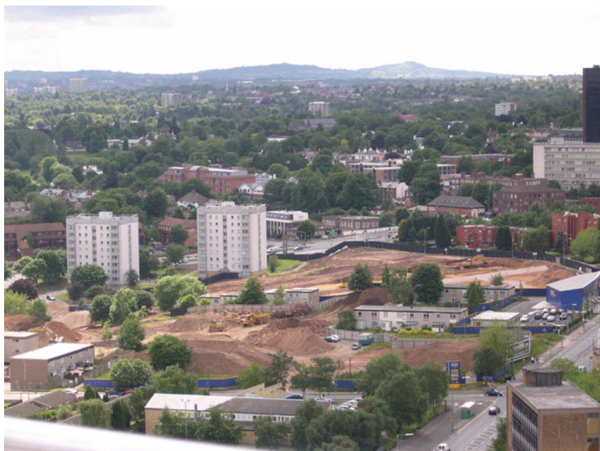
Fig. 6.9 Refurbished tower blocks alongside cleared sites being prepared for new parks and new mixed-tenure housing.

Lees (2008) suggested that regeneration initiatives fail to improve the quality of life for neighbourhood residents and involve gentrification with ‘overwhelmingly negative effects’, particularly through displacing low-income groups. This does not hold for the Central Estates. They were in progressive decline and regeneration involving demolition and major capital investment represented an expensive change in approach. Continuing neglect would have further damaged the neighbourhood and prepared the ground for wholesale redevelopment or privatisation. Doing nothing would not have defended residents or public sector housing or prevented eventual gentrification. In the Central Estates, residents’ opposition to doing nothing was the catalyst for regeneration, demolition and tenure diversification. These were each regarded positively as changing neighbourhood dynamics: building private housing also generated funds for social housing renewal.