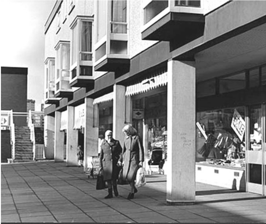
Fig. 6.5 Shopping opportunities in the housing estate, Lee Bank, Birmingham. Source Birmingham Library Archives and Optima Community Association, used with permission

clearance and demolition on the Central Estates exceeded £12 million: £50 million for refurbishment of social housing and £83 million for new social housing. The initial ERCF grant exceeded £46 million and included over £4 million for social and economic regeneration. Sales of land and property generated a further £20 million for reinvestment in the area. These figures exclude investment to build some 700 private dwellings in the first 10 years and a further 1,000 subsequently. A development agreement for the most ambitious and transformative part of the regeneration involved a lead private developer building under licence with the council and Optima as partners. After 10 years, 275 houses and 402 flats had been completed for social rent and a further 25 houses and 45 flats for shared ownership. Continuity in external designs made it hard to identify the tenure of properties: most new houses were rented from Optima, and most new private dwellings were flats. The clearance and demolition programme had been completed along with substantial new building when the credit crunch affected private sales: the developer stopped building for sale in 2008 and it was 2 years before construction restarted. Two blocks of apartments, held at shell construction stage pending sales, were sold to Optima as additional social housing, at below 50% of