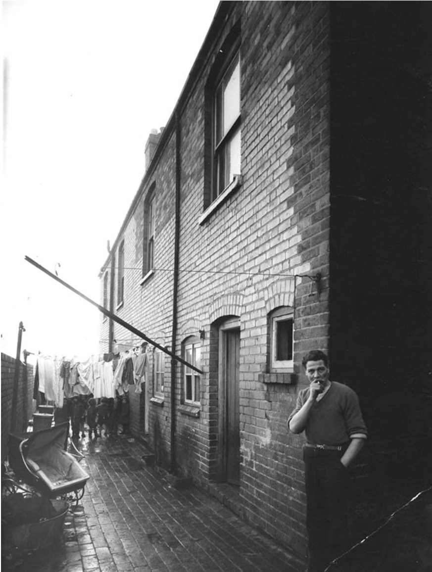
Fig. 6.2 Rear entries to Victorian terraced housing, 1950s, Birmingham.

participation—seven tenant Board members elected by tenants, three council nominees and five ‘independents’.