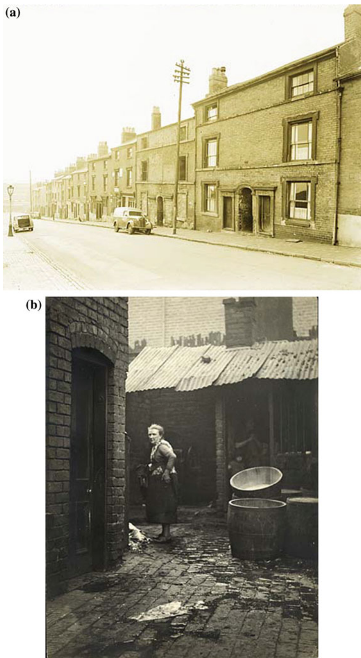
Fig. 6.3 a Streetscape of typical slum properties before clearance, Birmingham b Rear yard of slum property before clearance, Birmingham.